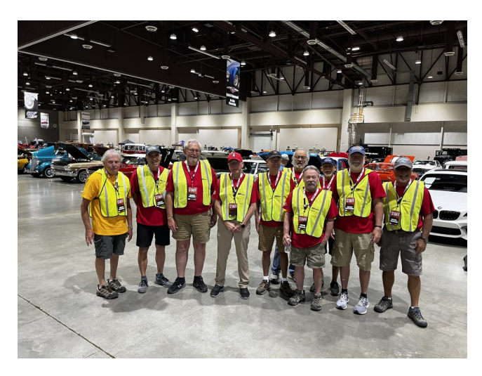
Saturday's RBCC crew