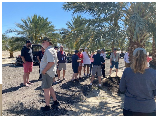
Date Farm Visit!