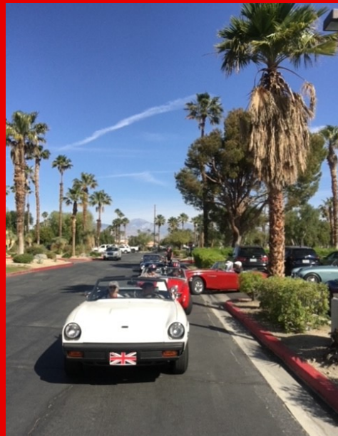
More from Cathedral City