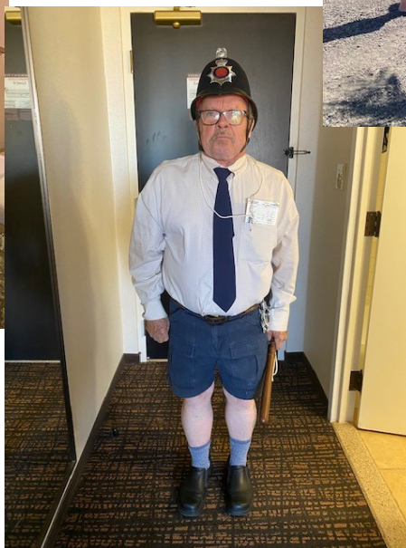
Look at those pasty white legs!