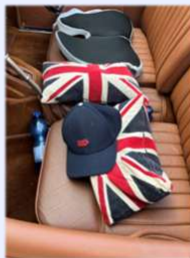
This Jaguar was racing in the Mille Miglia. The British pillow was on the seats of the Jaguar.