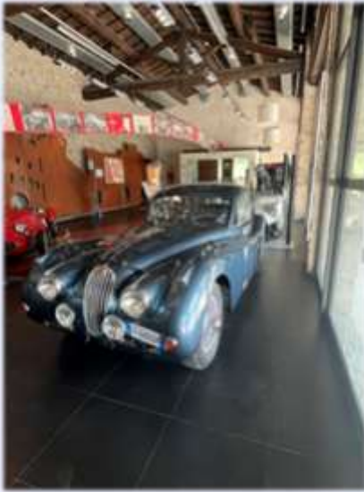
1956 Jaguar XK 140 Coupe