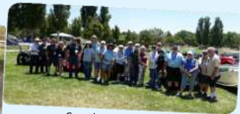
Sample of a club photo