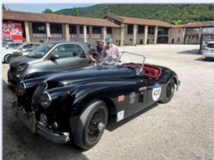
Another Jaguar in the race.