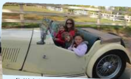
Faithful daughter and grandkids