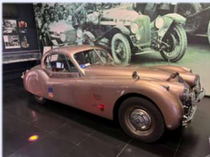
1952 Jaguar XK 120 – in the Mille Miglia Museum