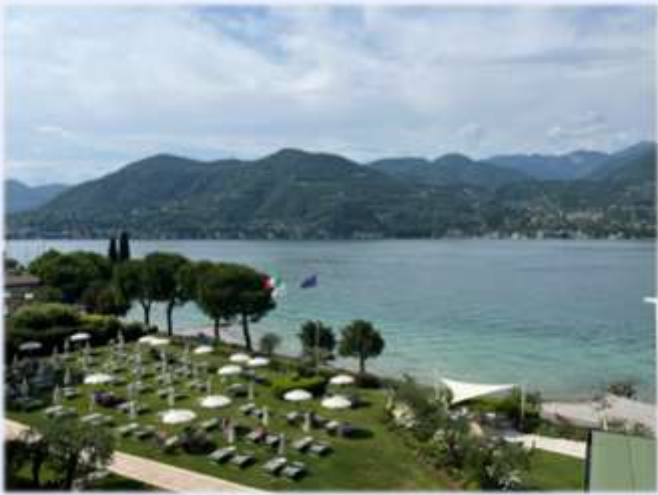
View of Lake Garda from our hotel room.