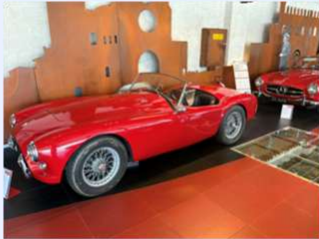
1955 ACE Bristol

After the race, we made our way to Lake Garda and checked into our beautiful hotel on the eastern shore. During our 3-day, 4-night stay, we had the chance to visit the Allegrini Vineyards, nestled in the heart of the Valpolicella region. The vineyard surrounds a stunning 16th-century medieval palazzo , offering a picturesque and historic backdrop. Our visit included a guided tour, a wine tasting, and a delicious "Italian" lunch.