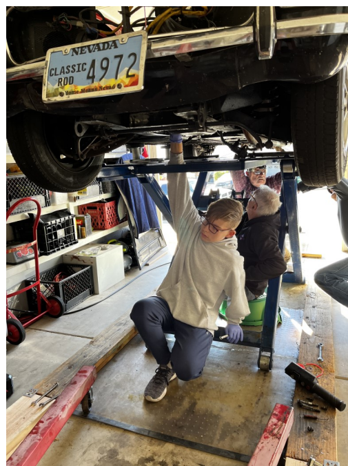
New generation RBCC member.